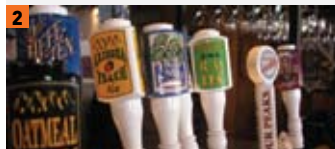
2 Four Peaks Brewing Company 1340 E. 8th St. Tempe, AZ 85281 480.303.9967 fourpeaks.com