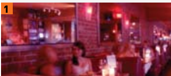
1 Zuma Grill & Lounge 605 S. Mill Ave. Tempe, AZ 85281 480.829.6775

This brewery provides major historical value for Tempe. The brick warehouse was originally built in 1892 and was the home for Pacific Creamery and later Bordens Creamery. Now Four Peaks Brewery , the restaurant offers a large selection of hand crafted beers and brewer's favorite foods. If you want to experiment with the wide range of ales, this brewery is one of the top spots in Arizona to do it. Take a break from the Mill Ave. chaos and enjoy more of a mellow atmosphere while taking in some Tempe history.