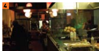
Namu 439 Balboa Street San Francisco, CA 94118 415.386.8332 namubar.com