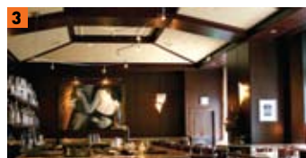
The Cosmopolitan 121 Spear Street San Francisco, CA 94105 415.543.4001 thecosmopolitancafe.com